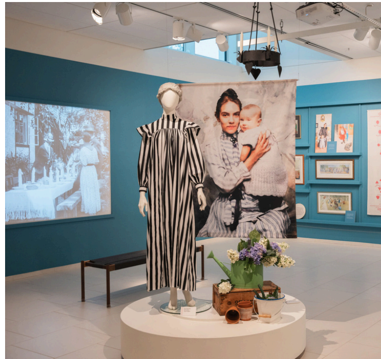
Exhibit information can be found on the ASI website .

From now through October 27, you can view the work of Karin Larsson at the American Swedish Institute in Minneapolis. According to the ASI website, “Karin Bergöö Larsson (1859–1928) was a groundbreaking artist whose approach to textiles and design ushered in a new era of interior design and established the iconic Swedish style that continues to inspire contemporary artists worldwide.”